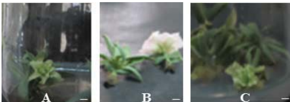
Fig. 2. In vitro flowering. A and B – flower induction on lateral buds formed in medium supplemented with 0.1 \text{ mg L}^{-1} BA without or with 0.1 \text{ mg L}^{-1} NAA, Bar = 5 mm; C – flower induction on callus formed in medium supplemented with 0.1 \text{ mg L}^{-1} BA along with 2 \text{ mg L}^{-1} NAA, Bar = 5 mm

Flower induction. The studies show that the addition of plant growth regulators, especially cytokinin to the media has a significant influence on E. grandiflorum flowering. Our study revealed the flower induction on the both of callus and shoots. Flower induction occurred on the shoots grown on the media containing 0.1 \text{ mg L}^{-1} BA without and with 0.1 \text{ mg L}^{-1} NAA (fig. 2). Flower also appeared on the callus produced on the medium supplemented with 0.1 \text{ mg L}^{-1} BA along with 2 \text{ mg L}^{-1} NAA (fig. 2). Normal floral structure was not observed in callus. Flower development in shoot tips grown on the mentioned above media was done completely (fig. 2).