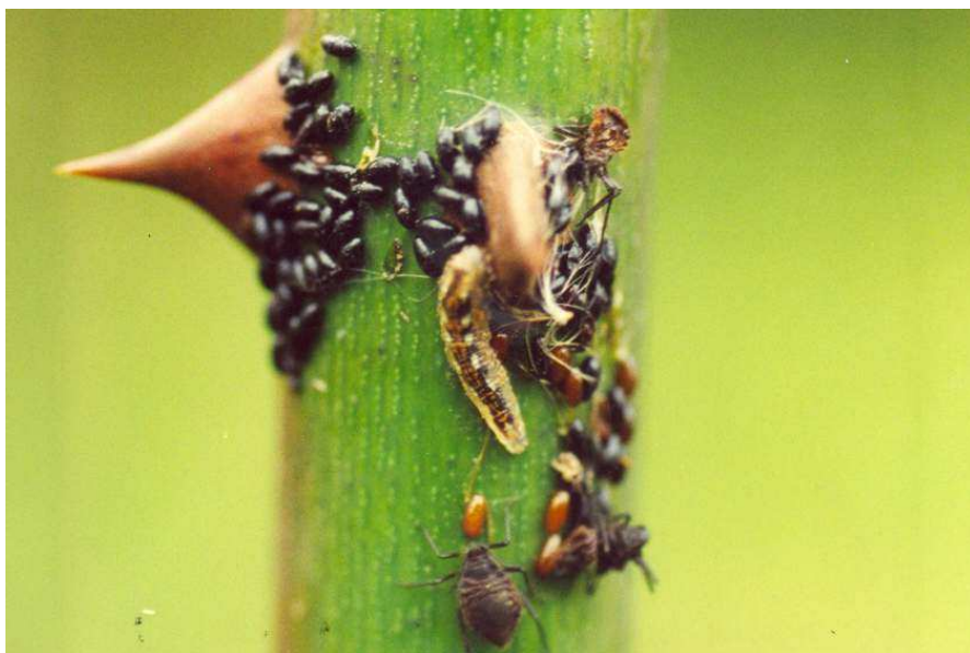
Photo 4. Aphids Maculolachnus submacula (Walk.) with their eggs and larvae of Syrphidae Fot. 4. Mszyce Maculolachnus submacula (Walk.) i ich jaja oraz larwa Syrphidae