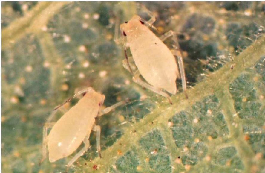
Photo 3. Wingless individuals of Metopolophium dirhodum (Walk.) Fot. 3. Bezskrzydłe osobniki Metopolophium dirhodum (Walk.)