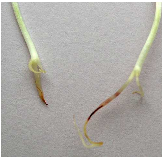
Photo 2. The necrosis of onion seedlings roots after artificial inoculation by Fusarium spp. Fot. 2. Nekroza korzeni siewek cebuli w wyniku sztucznej inokulacji Fusarium spp.