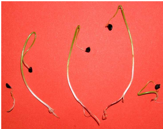
Photo 3. The onion seedlings infected by soilborne fungi Fot. 3. Siewki cebuli porażone przez grzyby przeżywające w glebie

Antagonistic microorganisms such as Bacillus spp., Pseudomonas spp. and Trichoderma spp. occurred in the soil after the cultivation of spring rye and common vetch [Pięta and Kęsik 2005]. It should be expected that the activity of those antagonists in the soil will limit the development of onion pathogens.