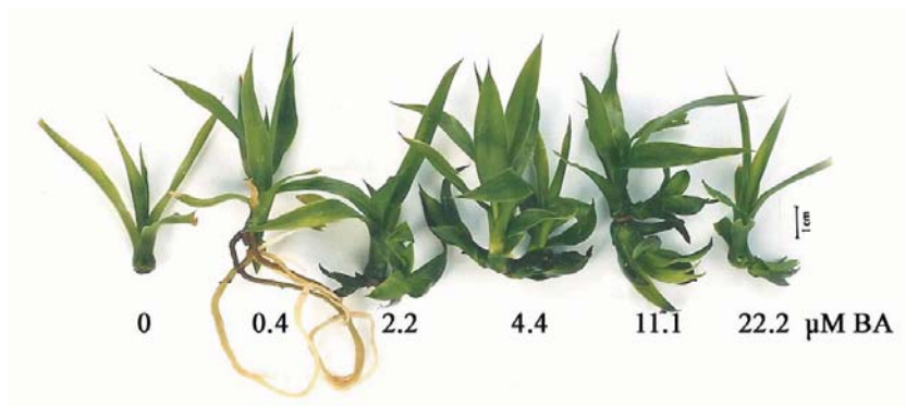
Fig. 1. Shoot regeneration from shoot tips of Yucca elephantipes on MS medium supplemented with different concentration of BA, after 8 weeks of in vitro culture

Ryc. 1. Regeneracja pędów z wierzchołków pędów Yucca elephantipes na pożywce MS uzupełnionej BA w różnych stężeniach, po 8 tygodniach kultury in vitro