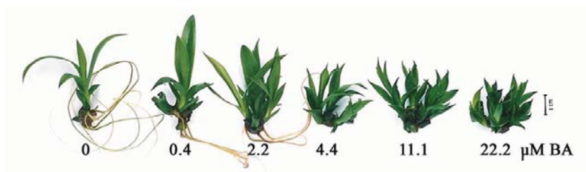
Fig. 3. Shoot regeneration from nodes of Yucca elephantipes on MS medium supplemented with different concentration of BA, after 8 weeks of in vitro culture

Ryc. 2. Regeneracja pędów z wierzchołków pędów Yucca elephantipes na pożywce MS uzupełnionej TDZ w różnych stężeniach, po 8 tygodniach kultury in vitro