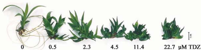
Fig. 4. Shoot regeneration from nodes of Yucca elephantipes on MS medium supplemented with different concentration of TDZ, after 8 weeks of in vitro culture

Ryc. 4. Regeneracja pędów z węzłów Yucca elephantipes na pożywce MS uzupełnionej TDZ w różnych stężeniach, po 8 tygodniach kultury in vitro